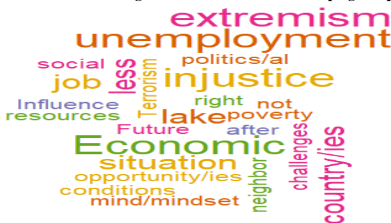
Figure 4: Word cloud of challenges in Pakistan for the developing of a peaceful culture

The above words cloud and recurrence both depicts the assessments of the respondents from this it was seen that significant difficulties looked by the country for creating peace culture in university climate were connected with the economic condition (12.90 %), joblessness (12,90%), bad form (12.90%) and radicalism (12.90%). Roughly 13% recognized these four significant difficulties looked at by Pakistan for creating a peaceful culture in the universities. Further, the respondents were proposed that with the execution of equity in the administrative level and the departments in term of