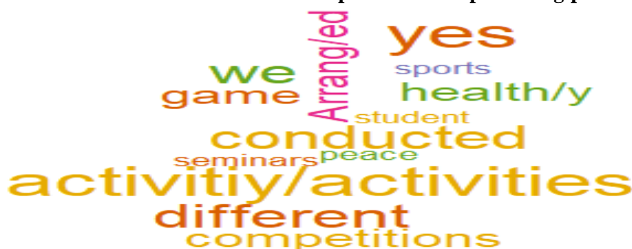
Figure 5: Word cloud related to activities in the departments for promoting peace in youth

Table 5 gives the data about the various procedures that university departments were received for the advancement of peace culture, the various heads of the departments have various sentiments towards the techniques, the absolute first system is connected with the various exercises (14.71%) were embraced by the departments for advancing the peace among students, these exercises are connected with, discussions, composing and diverse game competitions few departments have designed these exercises of an on and a portion of the departments were arranged consistently, just as there were (11.76%) respondents utilized different methodologies that are connected with the various sorts of training, courses and workshops for the students and instructors to the attention of peace. Around (9%) departments pay attention to games, competitions, healthy exercises, and excursions to create positive attitudes in the students' behavior.