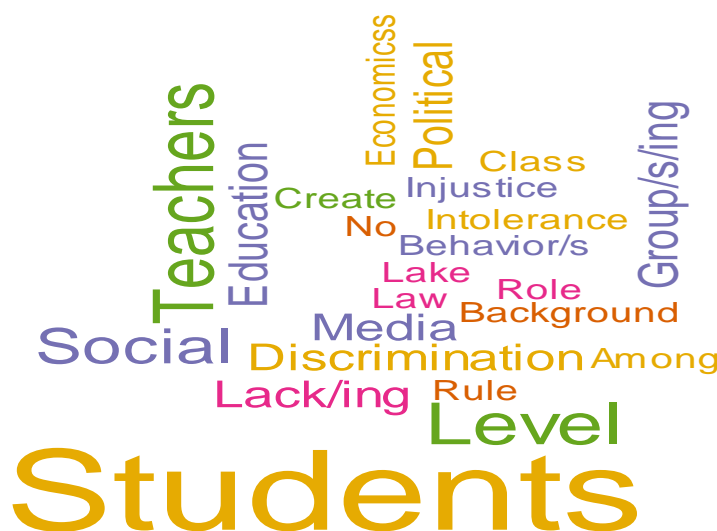
Figure 1: Situation of intolerance in the universities

The above table shows that intolerance in universities is the main cause or hurdle in the peace process in educational institutions, the table, and word count indicated that the highest factor related to the students' background (23.81%) after that class or financial levels (11.90%) also affect the peace progress, moreover, the cultural influences and teacher behaviors (9.52 %), furthermore, all the respondents agreed that the peace process is related with the change in the internal behaviors of the teachers and related persons.