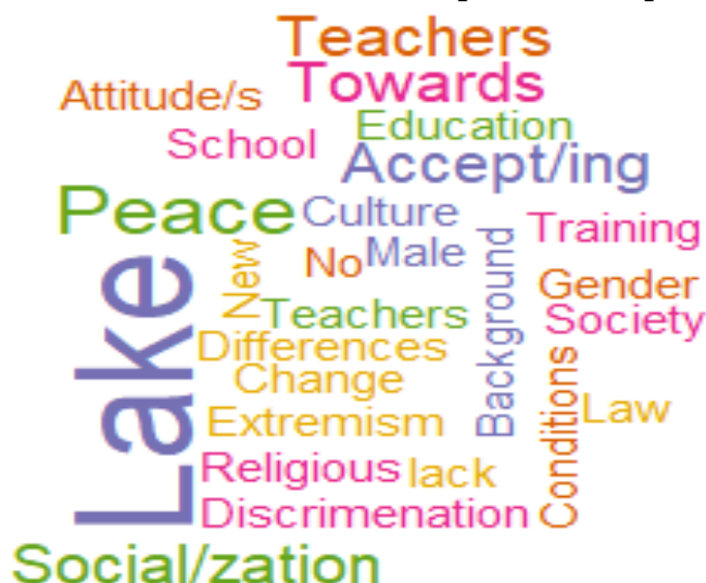
Figure 2: Word cloud of obstacles for the sustainable peace development

The above table 2 uncovered that most powerful obstacles that are faced in the development of peace culture in the universities of Pakistan, high pool of socialization, this is (40%) that shows that the pool of socialization related with the pool of segregation, pool of regard towards contrasts and pool of ethics these interrelated terms are the significant hindrances for harmony making measure in the universities, further, acknowledgment of peace culture have (20%) word checks which implies that there is need to create acknowledgment of various societies among students and preparing of the people for the acknowledgment of various societies required the consideration of the educators and organizations, it was seen by the assessments of the respondents that to give greatest expectations towards the social and civic character working of the university students in which such countless things are remembered for term of communication, moral development of events and the general day by day schedules these efforts accommodating for the advancement positive attitude for the change of peace culture.